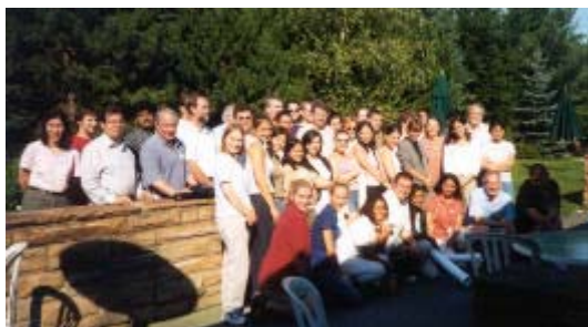
2003 CIMD Retreat and Picnic

Center for Immunology and Microbial Disease Albany Medical College 47 New Scotland Ave., MC-151 Albany, NY 12208-3479