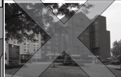
D-Building Entrance Closed