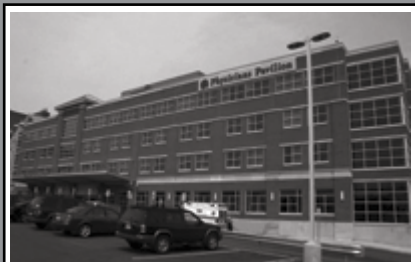
Physicians Pavilion A-Building

Blue Parking Lot Complimentary Valet Parking